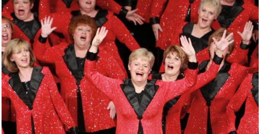
1st Place Overall—Pride of Toledo Chorus (602), Houston Bound

Congratulations to all of our chorus and quartets who competed this year! We had a wonderful time at our beautiful new venue, and can't wait for it to all happen again next year!