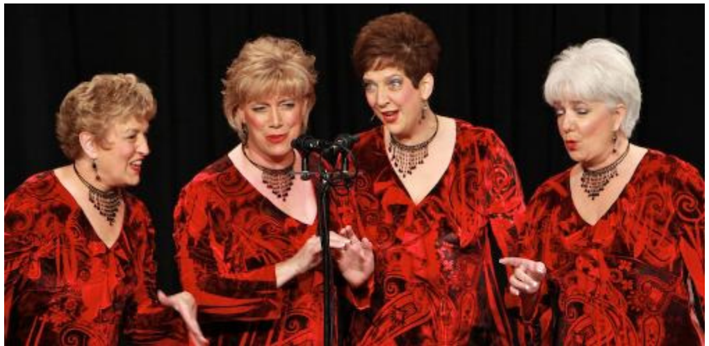
1st Place & Live Wire Start Performer Award—B.L.A.K. Velvet Quartet (606), Seattle Bound